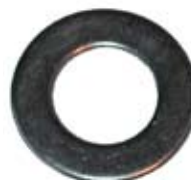
Large Washer (1)