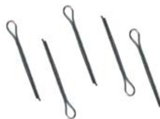
Cotter Pins (5)