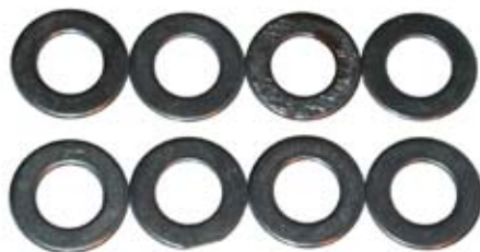
12x32mm Flat Washers (8)