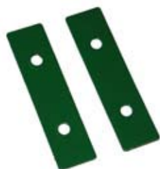
Flat Plates (2)