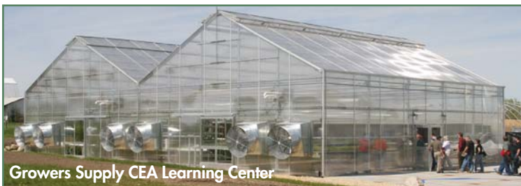
Growers Supply CEA Learning Center