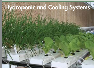
Hydroponic and Cooling Systems