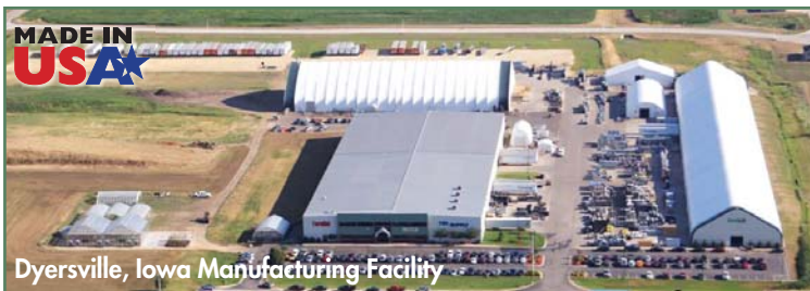
Dyersville, Iowa Manufacturing Facility

Since 1979, Growers Supply has offered cost-effective, versatile and energy-efficient greenhouses and provided the highest-quality products at the most economical prices to the growing and agriculture industry. We provide in-house design, manufacturing and construction, and pride ourselves on offering superior customer service; that's why our experienced greenhouse specialists are highly trained to help you determine the best greenhouse and setup for your needs.